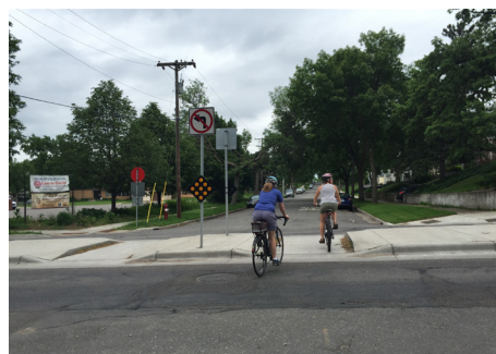
Median Refuge in Minneapolis, MN