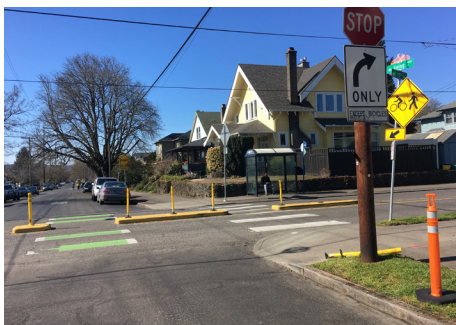
Volume barrier only, Portland, OR

Crosswalks and bike crossing markings are recommended