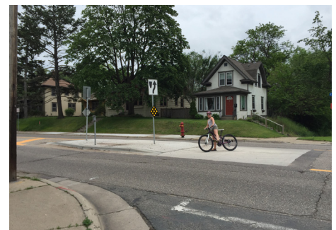
Median Refuge with left turn permeability